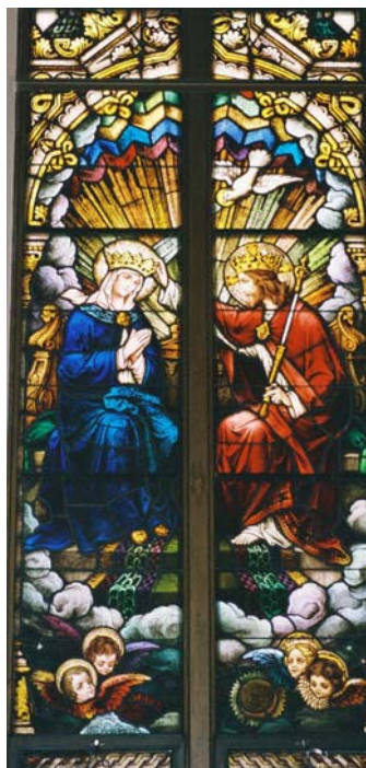
Window #10 on the southeast side of the church portrays the Coronation of Mary as Queen of Heaven.

Our history tells us that all the windows were placed in the church during the 1930’s, generously donated by the patrons whose names are displayed at each window. Next time you’re in the church, take a few moments to notice each one of these beautiful pieces of art again. Notice the brilliant, jewel-like colors, and look at the symbols in the rosettes at the top. Look at these beautiful windows again, as if for the first time. ☩