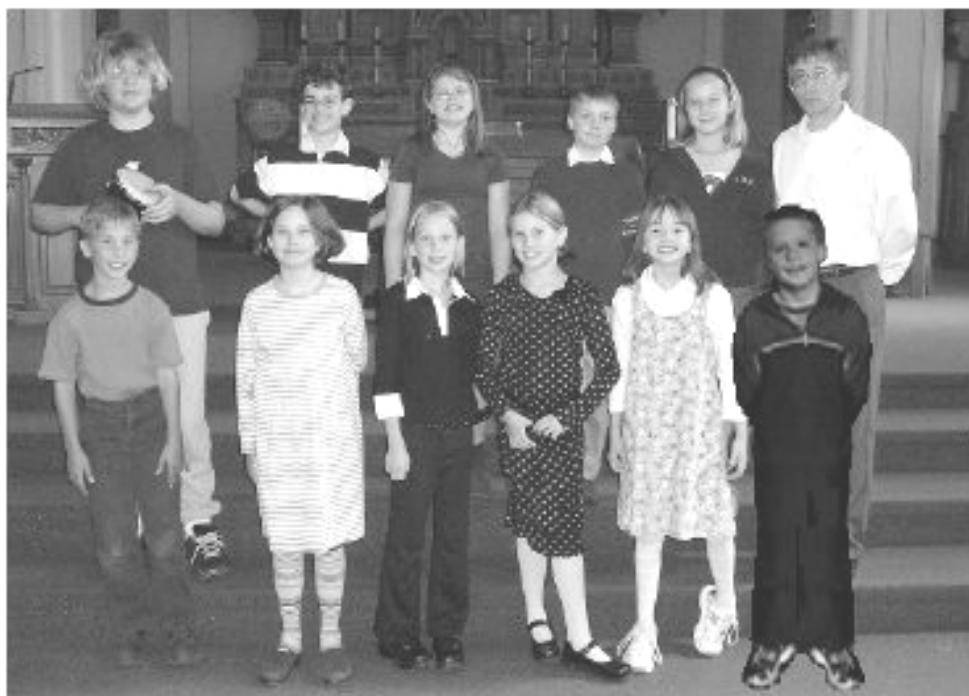
Youth Choir Members: